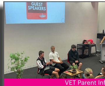
VET Parent Information Evening