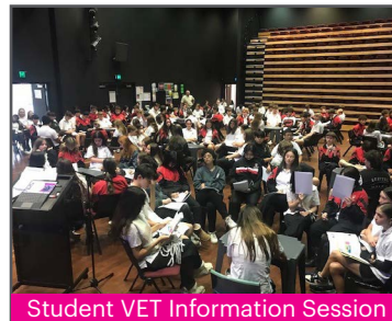
Student VET Information Session