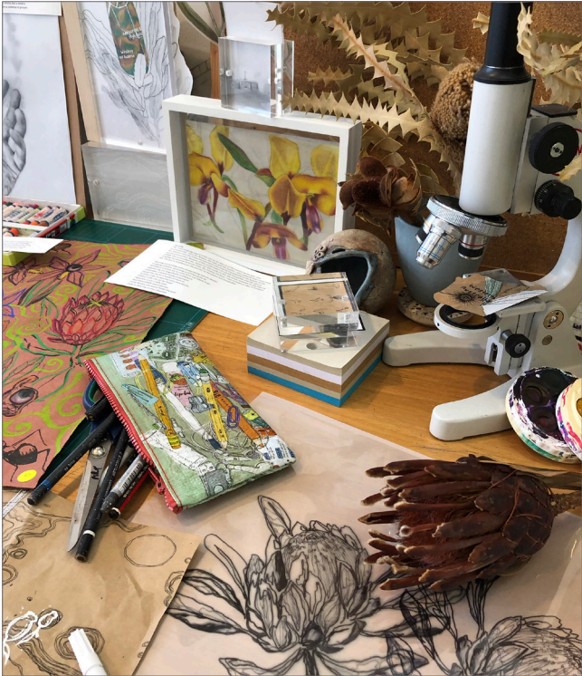
RESPONSE TO SITE STUDIO - WIRELESS HILL YEAR 8 GATE STUDENTS - 2020

As a member of the GAT Visual Art program students are expected to meet and maintain excellent standards in the general school program, Visual Art classes and Saturday workshops. This includes academic performance, attendance, participation and behaviour.