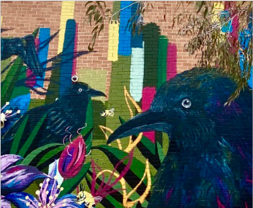
COLLABORATIVE MURAL - GATE STUDENTS - 2020

Just as much as the practical studio component it is expected that students will enthusiastically engage in the analysis, reflection and response process to artworks in social, political, historical and cultural contexts. A high level of visual literacy and written skills is expected. The weightings for the Responses section of the curriculum is increased for GATE students. Our courses follow the WA Curriculum and is delivered in a gifted context.