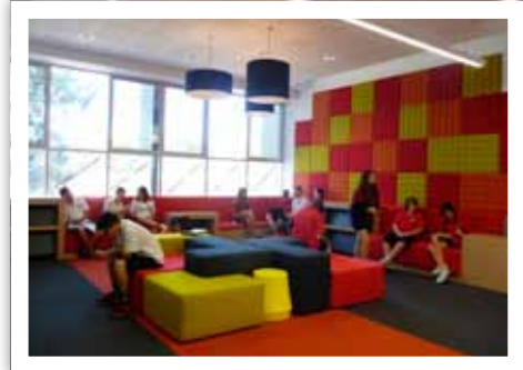
New library lounge area

Students' eyes lit up as they were welcomed into our beautiful new Library which opened this term. Gasps of wonder and excitement were heard as eager students surveyed the funky entrance lounge area, the light, bright and airy spaces and the elegant shelves and class areas.