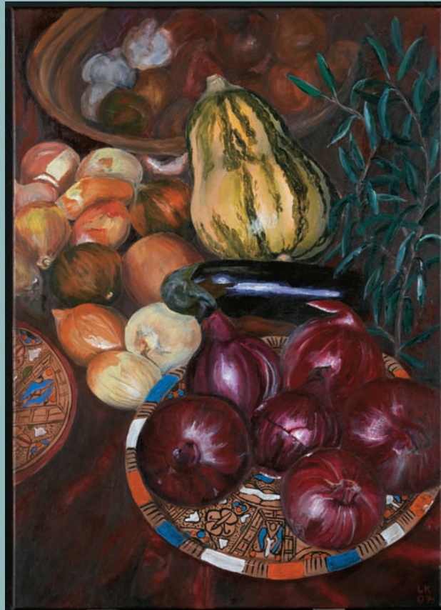
Artwork by Lilly Kaiser Year 12 2007

In 2007 year 8 students came from 54 public and private primary schools, plus 5 students from overseas and 1 from inter-state.