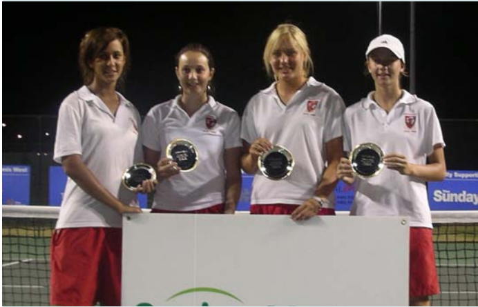
Winning girls team.

Winners of both cups: In the girls event Applecross 1 defeated Applecross 2 and in the boys event Applecross defeated Corpus Christi.