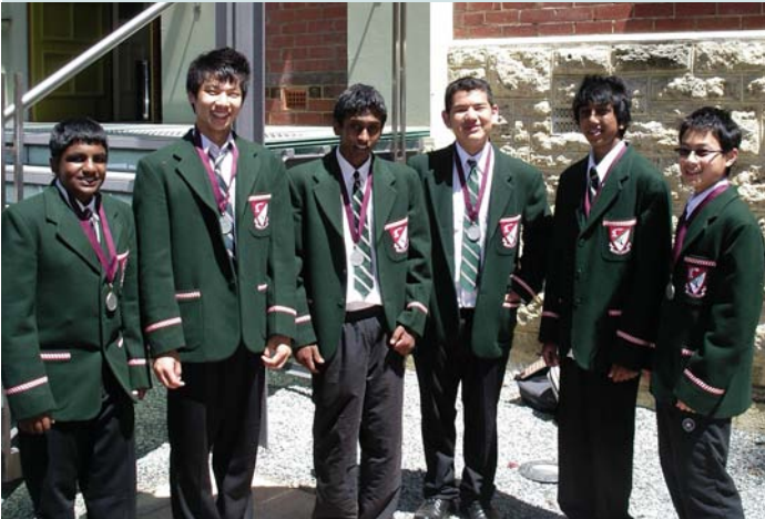
Year 10 Petroleum Club team.

Team of six Year 10 students gained 6th place.