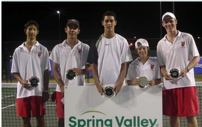
Winning boys team.