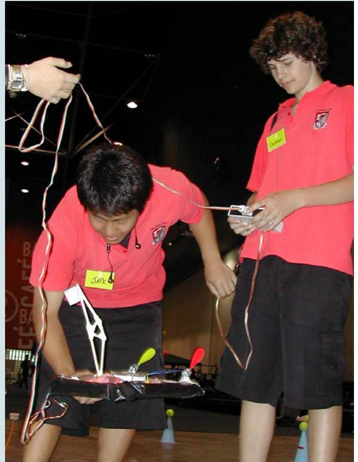
Year 9 students at the Challenge.