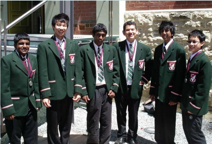
Year 10 Petroleum Club team.

Team of six Year 10 students gained 6th place.