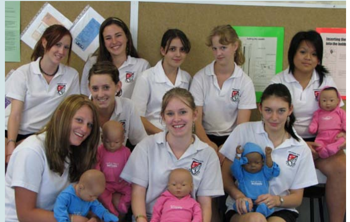
Students with Real Care Babies.

Year 11 & 12 Early Childhood Studies students involved in the program as part of their course.