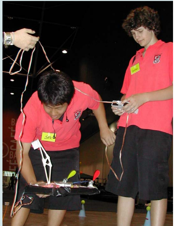
Year 9 students at the Challenge.