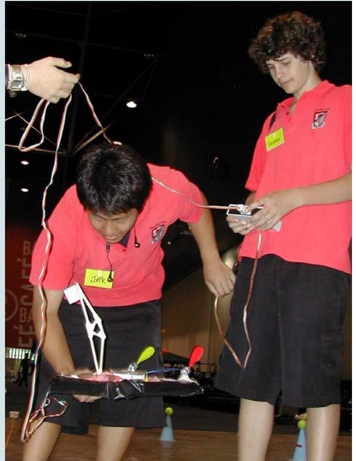
Year 9 students at the Challenge.