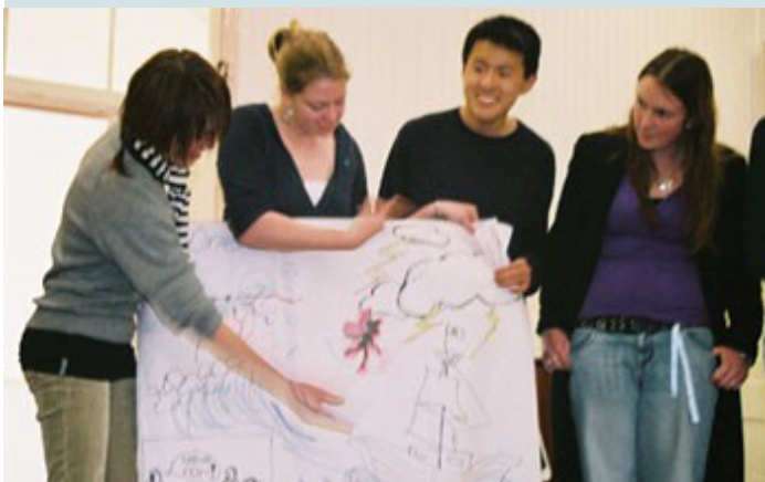
Students at Literature Camp.

The Literature result was either the highest or second highest score for 72% of Applecross SHSTEE students.