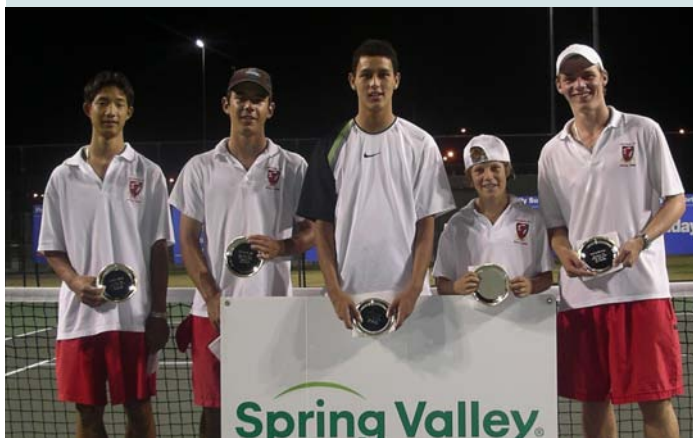
Winning boys team.