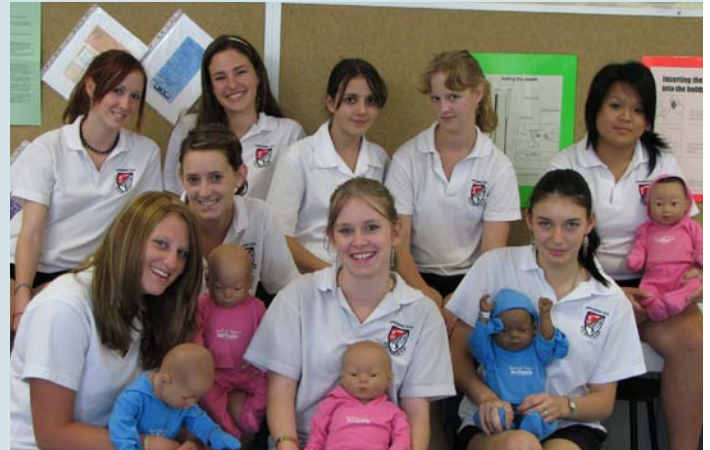
Students with Real Care Babies.

Year 11 & 12 Early Childhood Studies students involved in the program as part of their course.