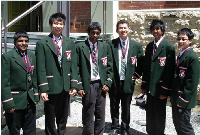
Year 10 Petroleum Club team.

Team of six Year 10 students gained 6th place.