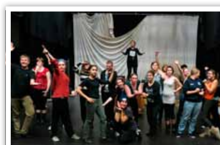
Caucasian Chalk Circle 4

Stage? Stage! We had to build a stage, and with our much beloved Brad Reid's shift interstate we found ourselves at a loss. We stumbled upon the hidden talents of Grant King, who helped to bring our rustic dream to life, with many castor wheels bought, and many pallets