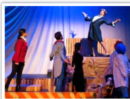
Caucasian Chalk Circle 2

Auditions were held late last year with the then Year 11 Drama students, to begin piecing together our Year 12 acting ensemble. This was no easy task! With, songs to be written, composed and choreographed, and over 50 roles to fill, it became clear that we had to expand our horizons, so an upper school production it became! Our team of directors was ready to attack the play. Collaboration was the most effective approach to the task and our Drama space was once again home to rehearsals, (yes the dreaded Sunday mornings) singing