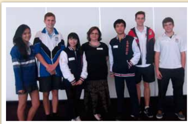
Combined School Workshop