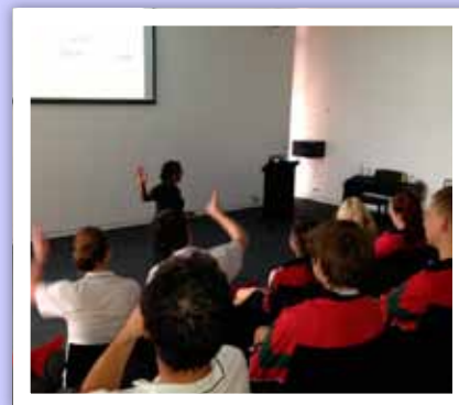
Start Smart Commonwealth Bank.